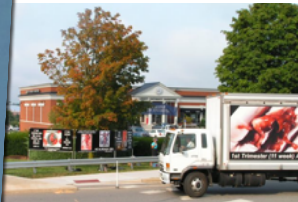
In front of the Liberty University Bookstore